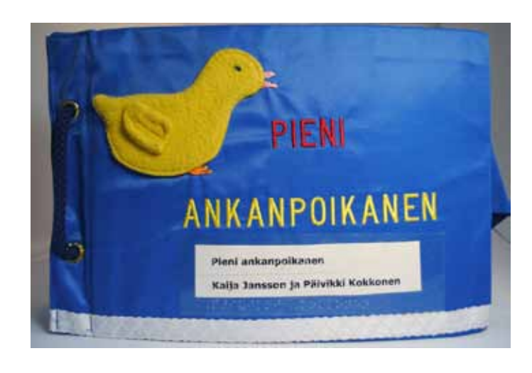
The title of the book is on the front cover. The book creator's name can also be on the front cover if it fits. Celia Library prepares the Braille text.

Always plan the book carefully before starting! This makes it easier to prepare the pictures and ensures that the finished book meets the readers' needs. Always begin by sketching the pictures. Prepare a separate sketch for each page. The sketches should include plans for textiles and other materials.