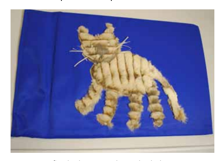
A finished page without the holes required for binding. If necessary, the holes and the binding are made by Celia. There is a wide binding margin on the left-hand side of the picture.

Book covers can be equipped with a fastener such as a strip of Velcro or buttons. This makes the book sturdier and protects the pictures.