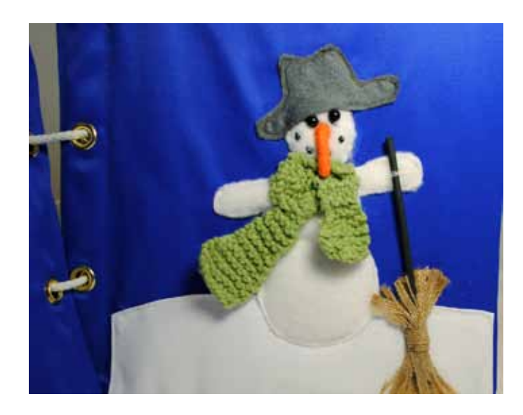
In addition to colours, pay attention to texture contrasts and choose lifelike materials. Frayed jute has been used for the snowman's broom. It feels different from the soft "snow" and resembles a real broom.

Select your picture materials with imagination and creativity. The more tactile experiences the book offers, the more it interests the reader. The book's creator should also study the book materials and their features by touch.