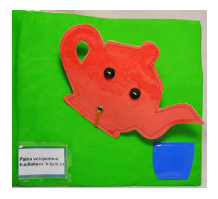
The pictures in a first book are simple. Underneath the teapot, there is a button which squeaks when pressed.

rent shapes and feel. Familiar objects may also be attached to the books.