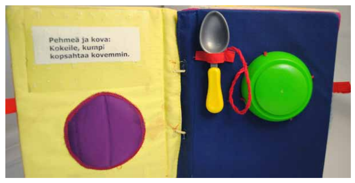
Books for small children can contain a variety of items which guide them to test how they function.

The books can describe the child's everyday life. Some pictures can depict unfamiliar or abstract things that the child may discuss with an adult. This helps the child learn new things and concepts.